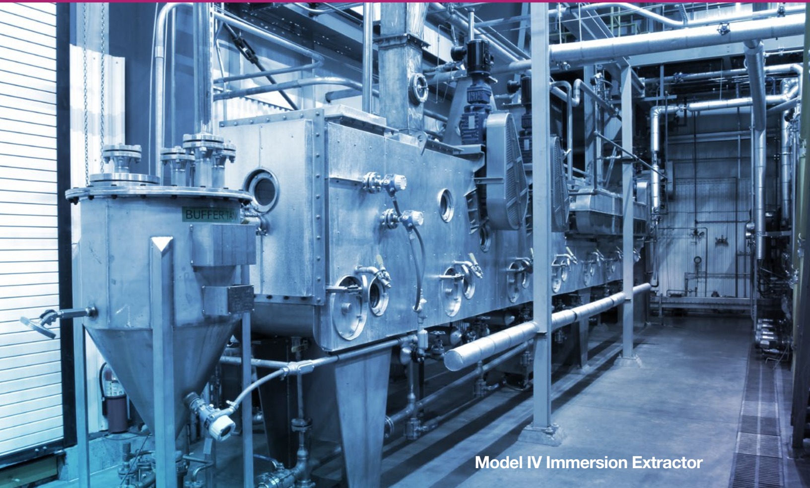
Model IV Immersion Extractor