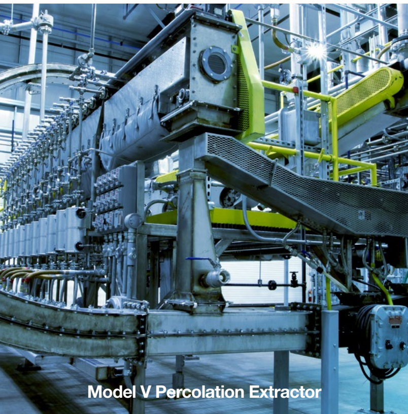
Model V Percolation Extractor