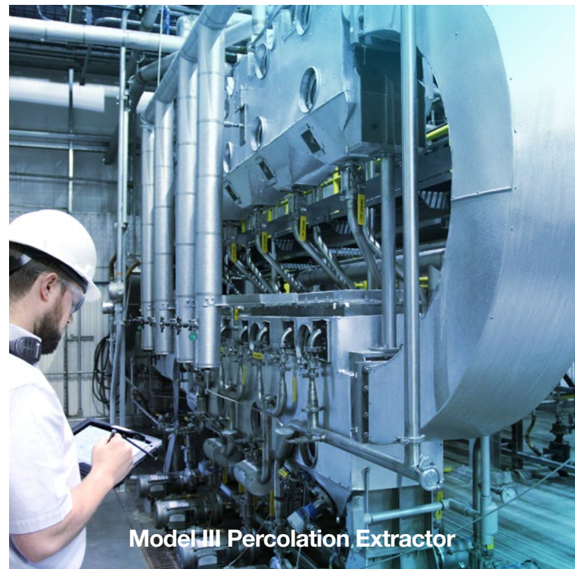
Model III Percolation Extractor

Oilseeds | Waxes | Proteins | Botanicals | Nutraceuticals | Products of Reaction | Continuous Washing of Recyclables